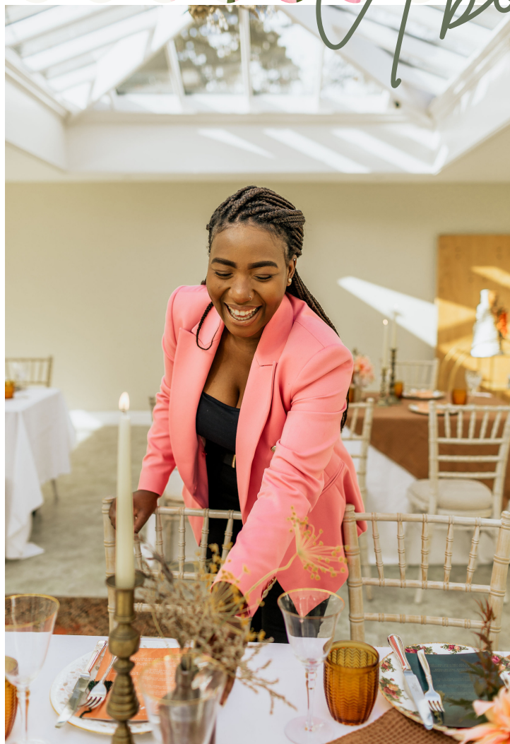
Hayne House - Hythe