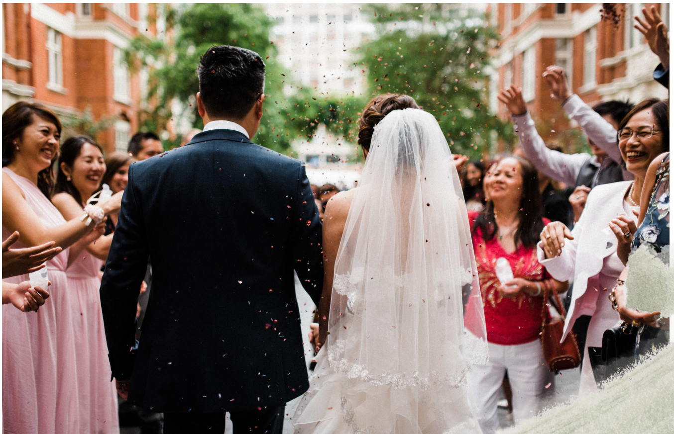
St. Ermin's Hotel - Westminster

I am here to ensure you enjoy the journey of a lifetime, leading to the day of your dreams.